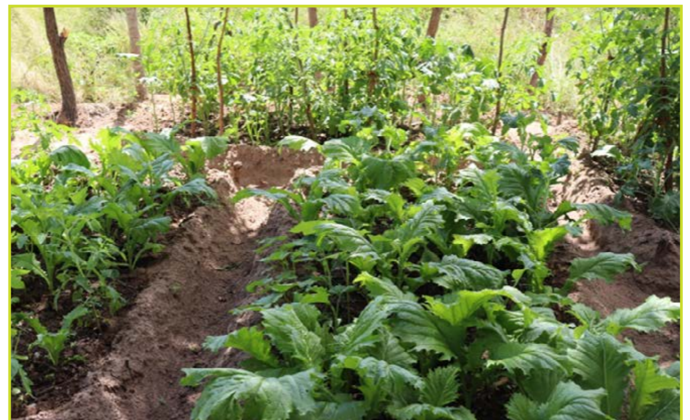
2022: Lorraine Shumba's resilience design plot displaying flourishing beds with a variety of plants in Ward 12.