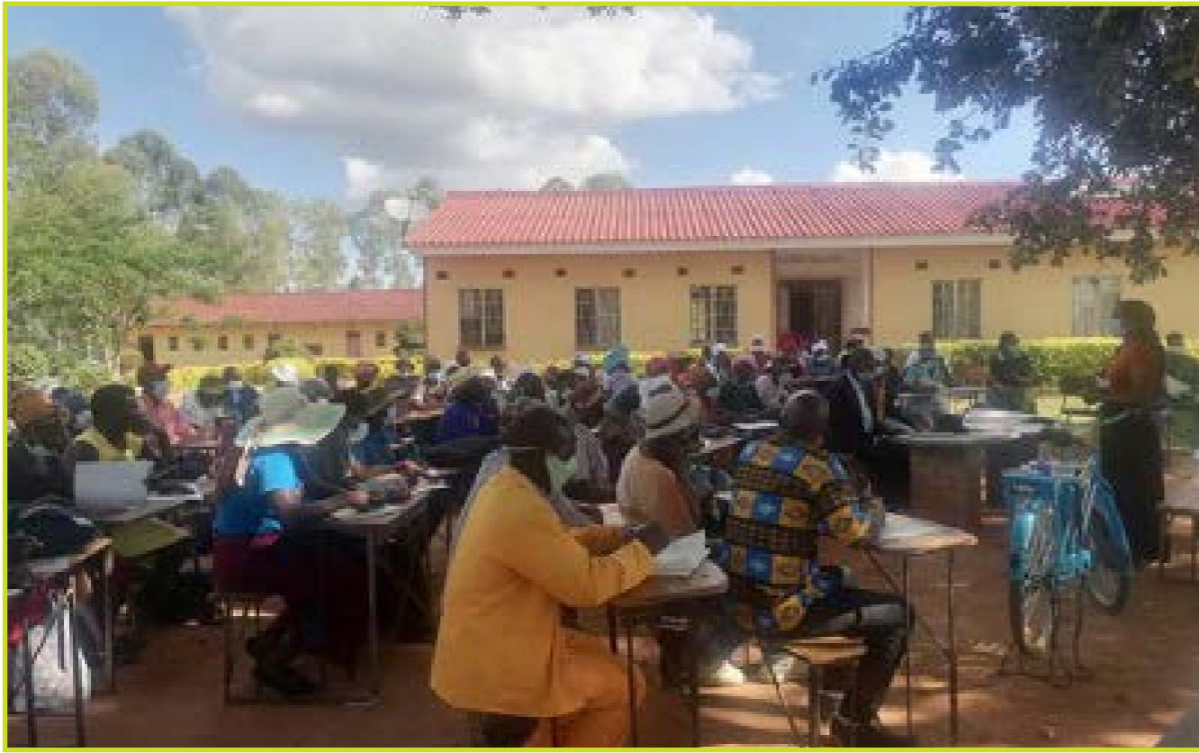
2022: A nutrition facilitator from Takunda conducts a care group training session in Ward 11, Zaka.