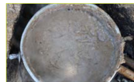
2022: Sorghum porridge with cow peas powder and dried vegetables (mufushwa).