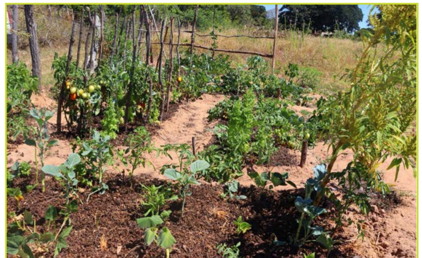
MARCH 31, 2022: A permaculture garden at Miriam Hove in average condition despite persistent hot and dry conditions.