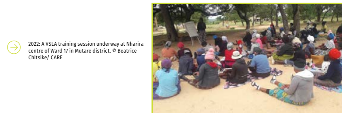
2022: A VSLA training session underway at Nharira centre of Ward 17 in Mutare district.