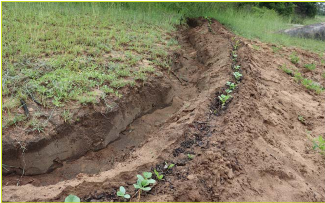
2022: Mustard rape and covo planted on contour berms at Lorraine Chigumira's homestead.