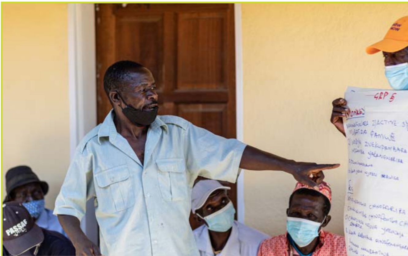
↑ MARCH 30, 2022: A participant from Group 5 presents on the characteristics and personality of a monkey advising if such traits are desirable in a leader.