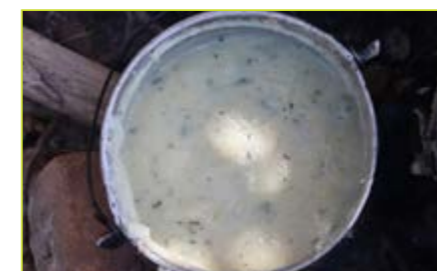
2022: Maize porridge with pumpkin leaves.