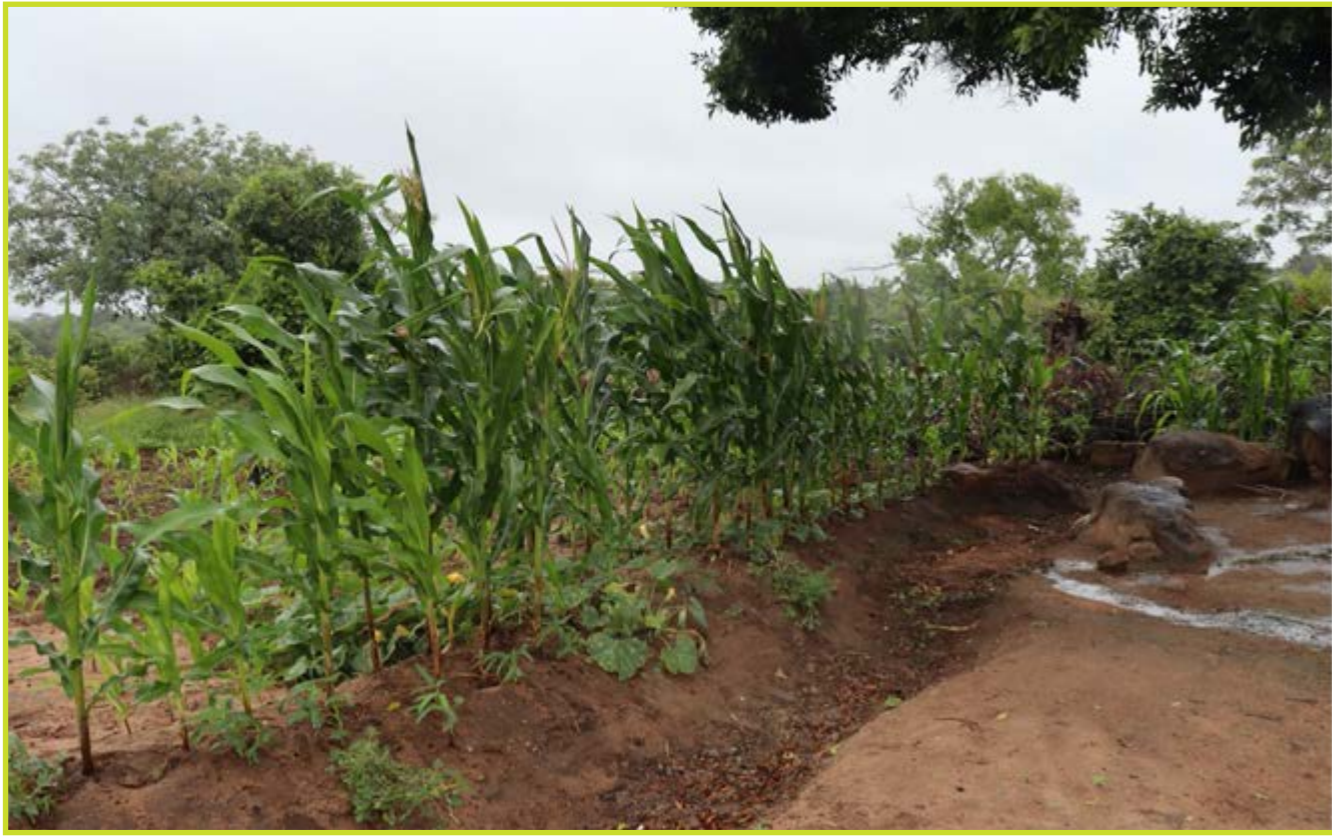
2022: Maize plants doing well on resilience design contour berms.