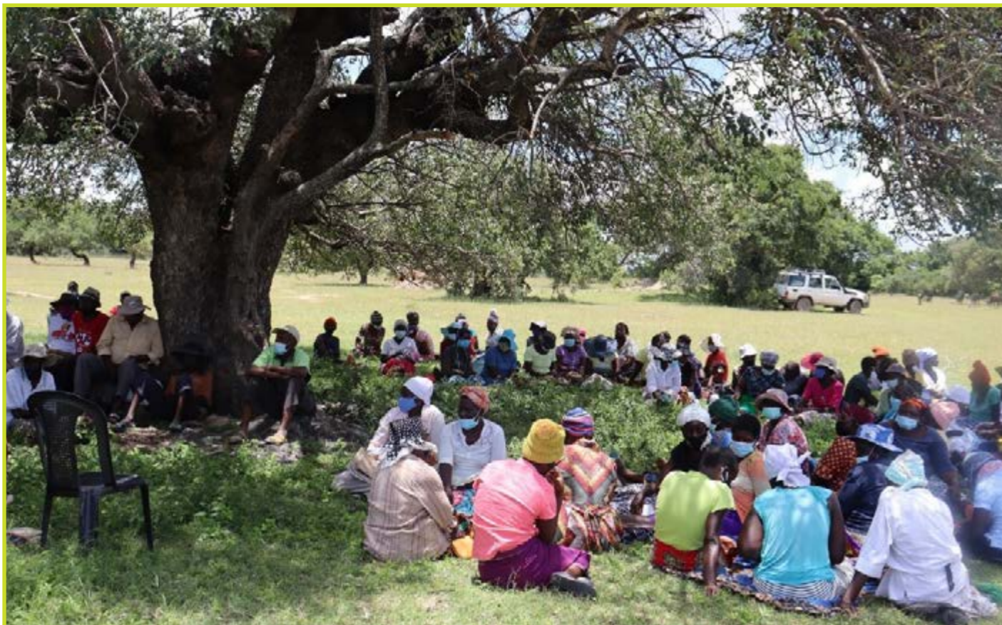
↑ 2022: Project participants from Ward 2, Cluster A listen attentively to a presentation on Takunda's areas of Interventions.