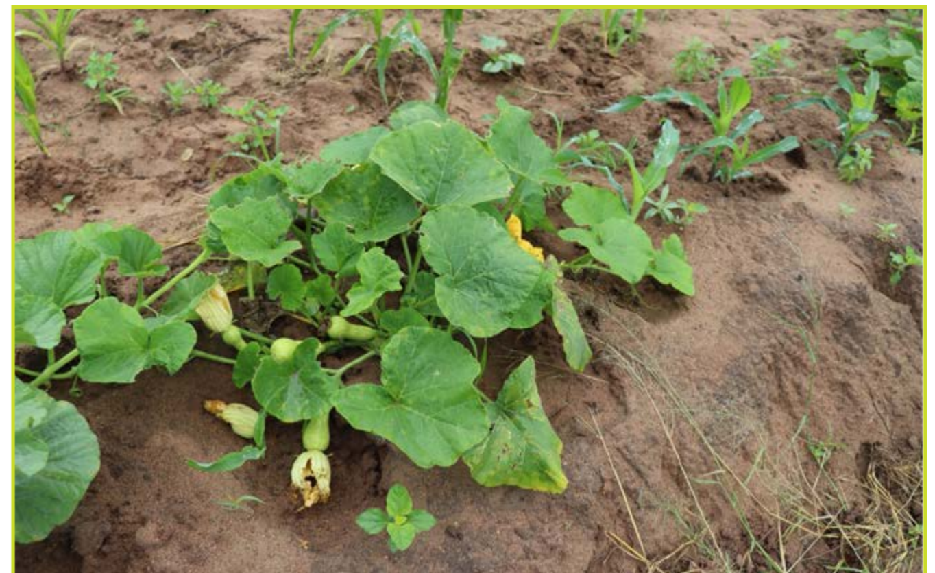
2022: Butternut crop planted on a contour now maturing.