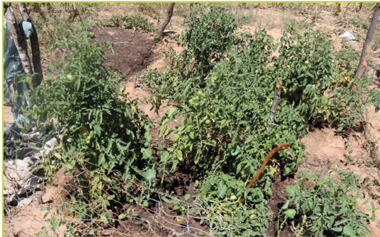
MARCH 31, 2022: Abnel Takawira's tomato crop showing signs of moisture stress due to prevailing high temperatures and dryspell.