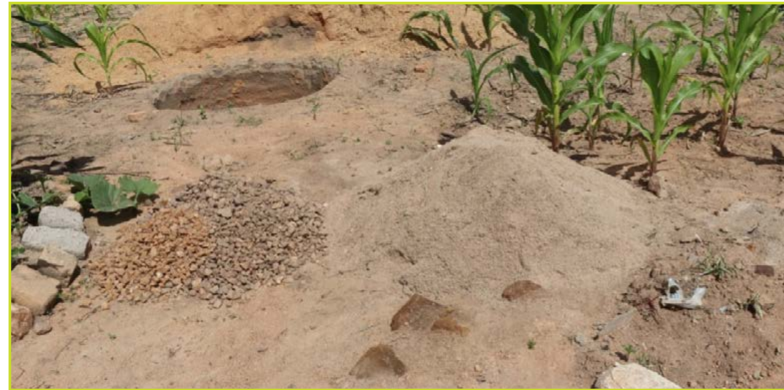
↑ 2022: A dug out latrine pit with river sand and quarry stones piled next to it for the next construction stage.