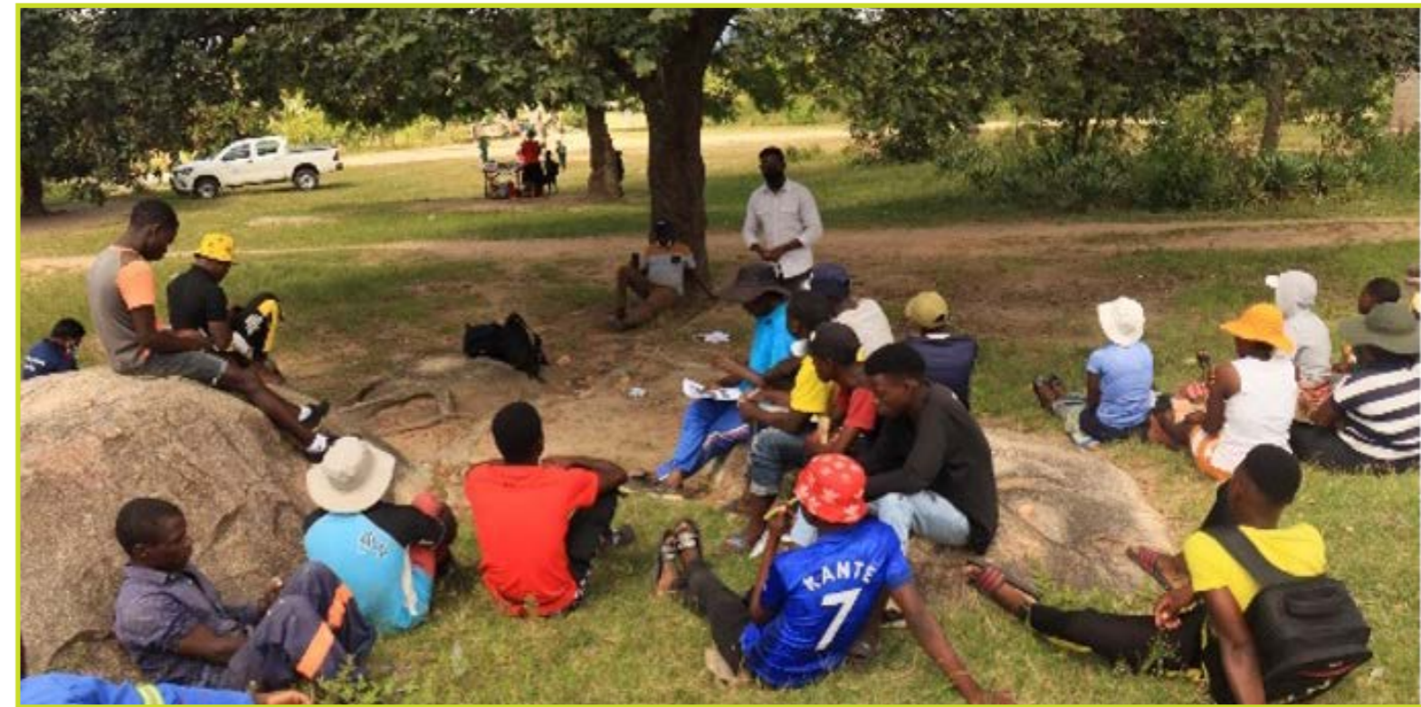
⬆️ 2022: A Community sensitization meeting and TVET Program registration in Ward 6.