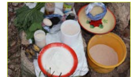
2022: Ingredients used for the demonstration.