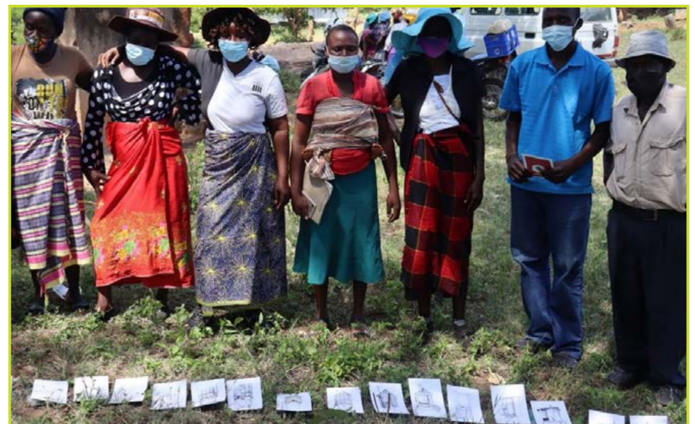
2022: Participants from Wards 28 & 29 stand in front of printed cards displaying the developmental steps to achieve safe sanitation as a part of a group work session on the sanitation ladder.