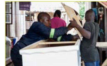
↑ JANUARY 13, 2022: Coffins and caskets are Vanessa's most reliable source of income and each holiday she mass produces enough stock for her mother to sell during the school term, "At first, we didn't have electricity and had to use manual machines and torches. Later, profits from the carpentry business helped us install plumbing and electricity at our house. Now we use electrical equipment".

Increased gender equitable income among extremely poor and chronically vulnerable households, women, and youth.