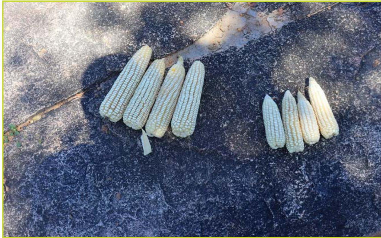
2022: On the left, maize cobs harvested from resilience design structures are noticeably larger than those from traditional plots, right.