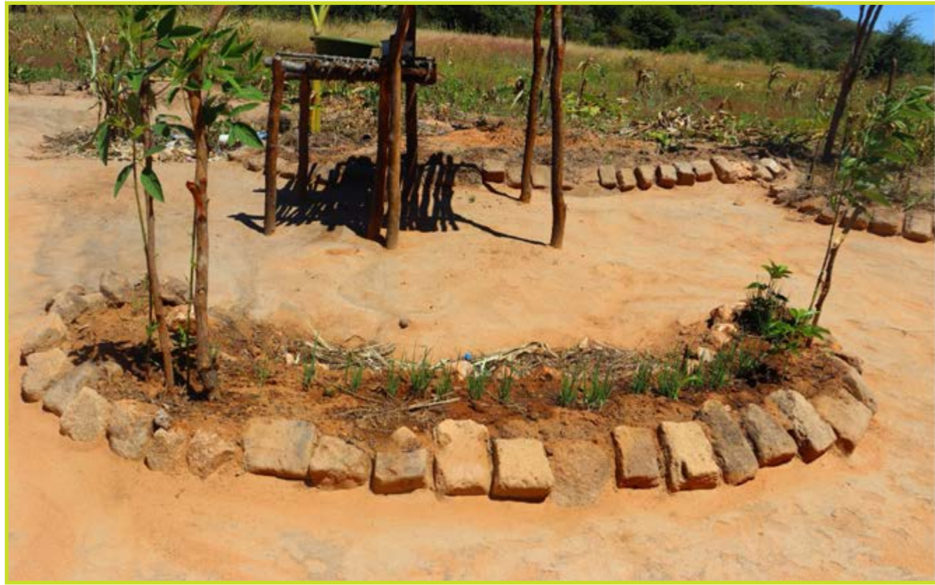
2022: Remaining RD structures (Halfmoons) at Leticia Jese homestead after harvesting.