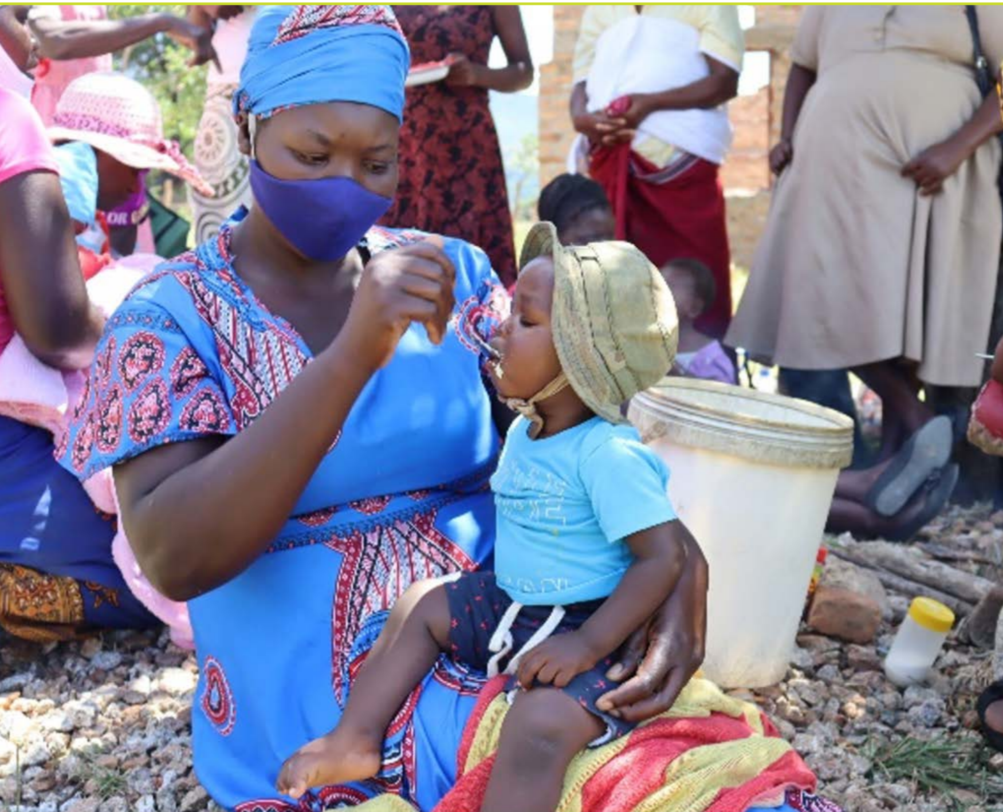
2022: A young mother holds a teaspoon of porridge to her son's mouth as he tastes the new porridge recipe in Mutare Rural, Zimbabwe.