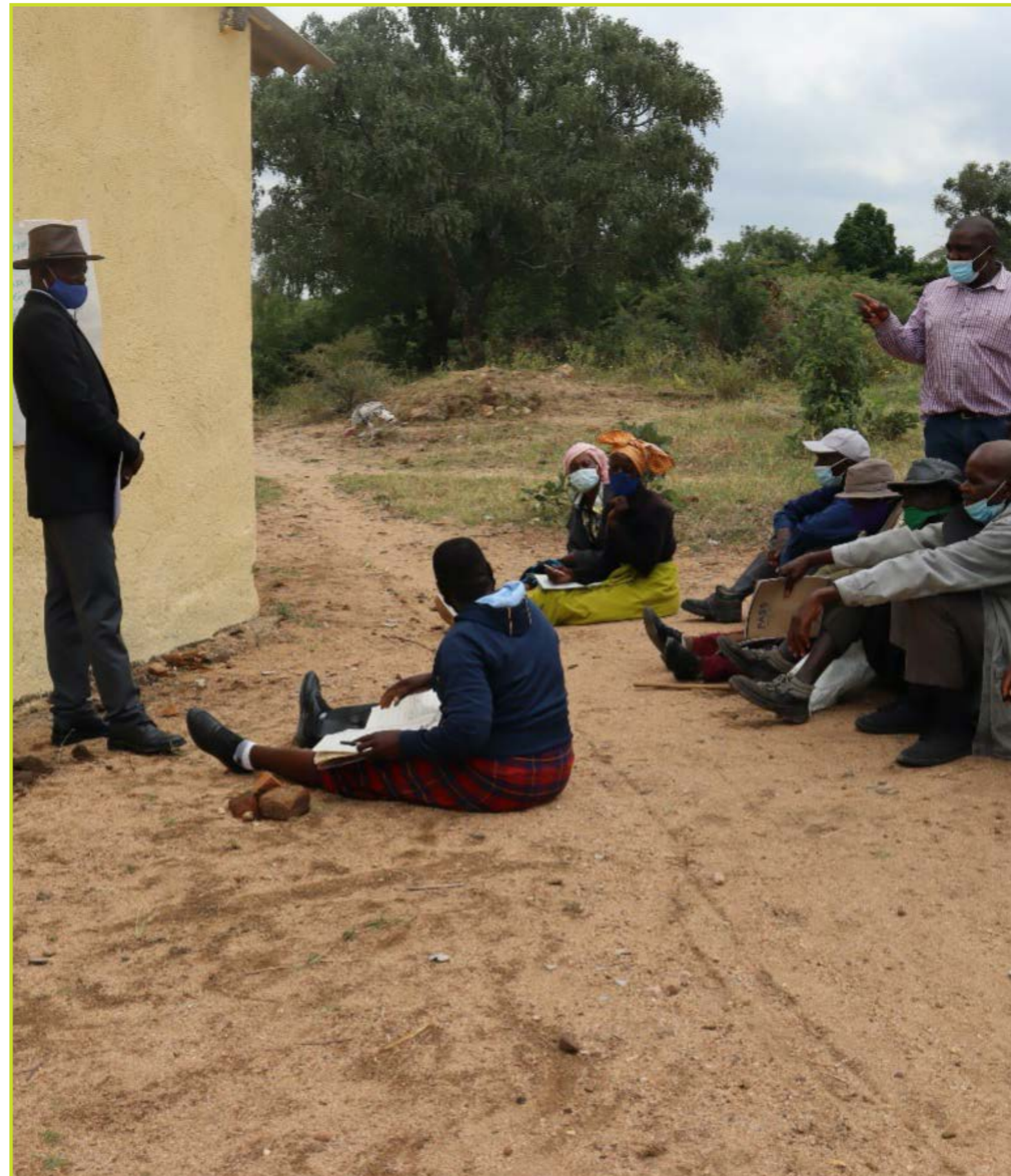
→ 2022: Members of community leadership tending to a group task during Training for Transformative leadership Training in Ward 13, Buhera.