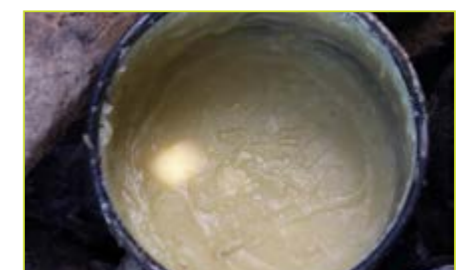
2022: Maize porridge with an egg.