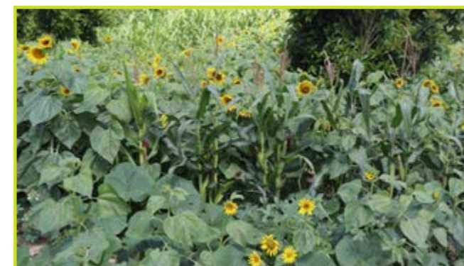
← 2022: A food forest at Mr & Mrs Muradzikwa's homestead embellished with more than five crops.