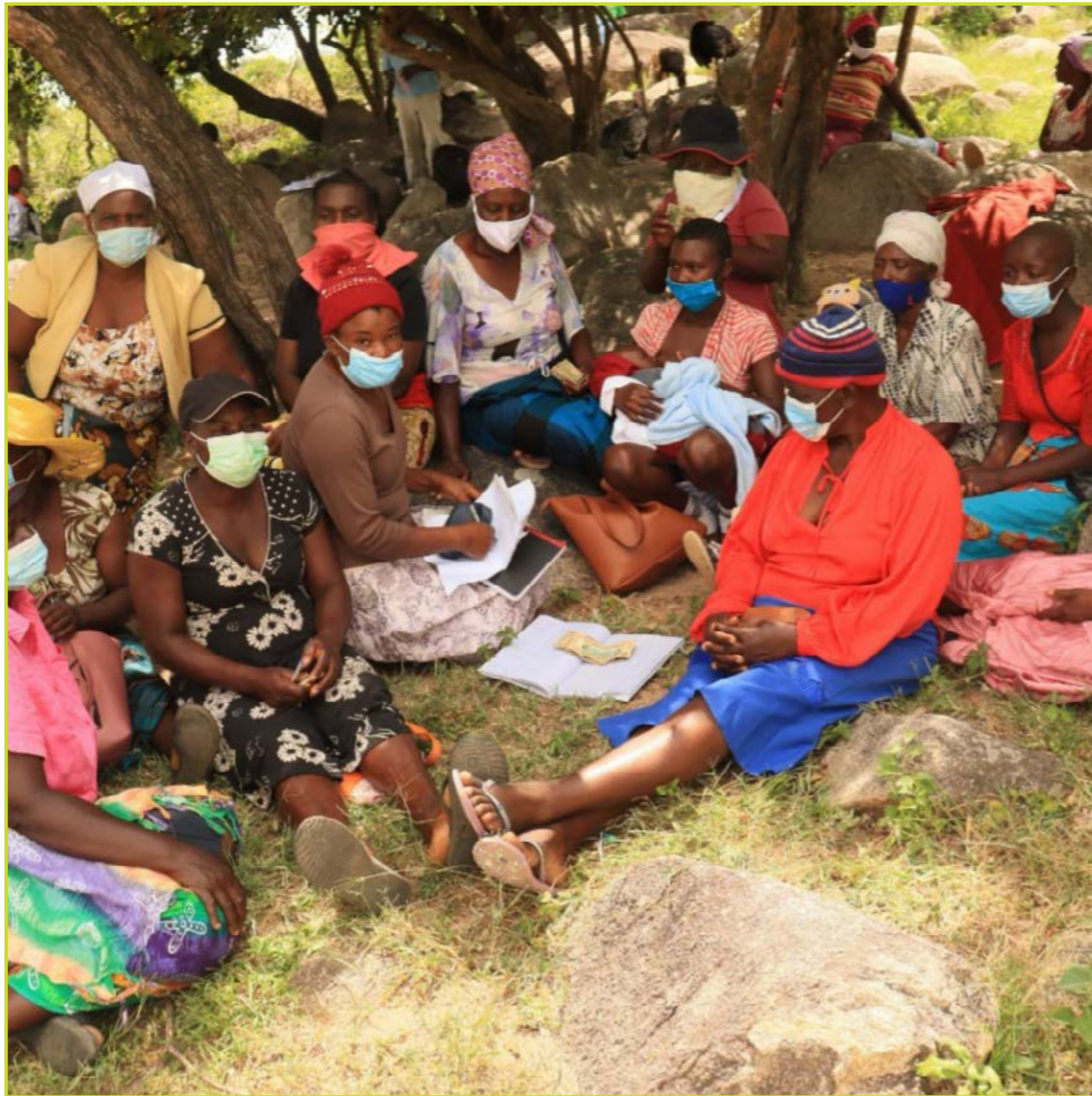
2022: Members of the Kudanana village savings loan association meet once a month at Muchiwanga Cluster 1 in mutare Rural to make their contributions and follow-up on loans taken.