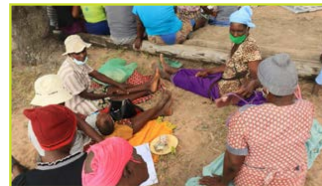
FEBRUARY, 2022: Women from Mandisekwe village, Murwira in Ward 17 undergoing VSLA training.