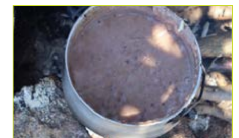
2022: Sorghum porridge with cow peas paste.