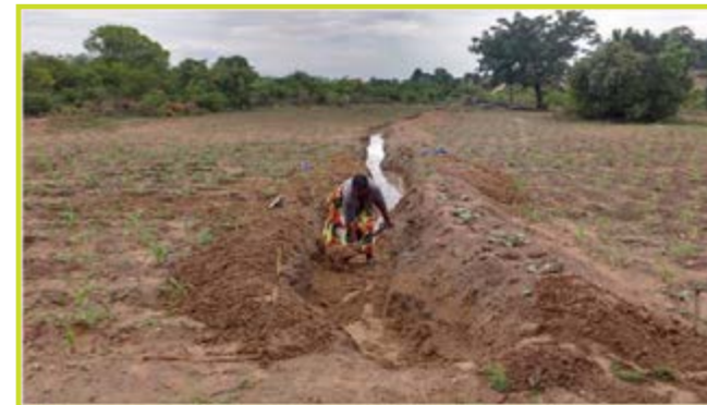
← DECEMBER, 2021: SIPHATHISIWE SIBANDA-GODHINI (49) a farmer in Zaka, shovels soil out of a dead level contour she will use to harness water.