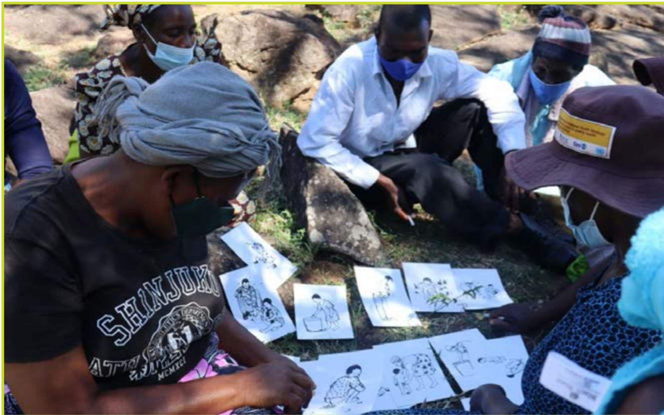
2022: Participants from Ward 28 and 29 in Zaka in a group session discussing the Germ theory, particularly, the bacteria transmission route.