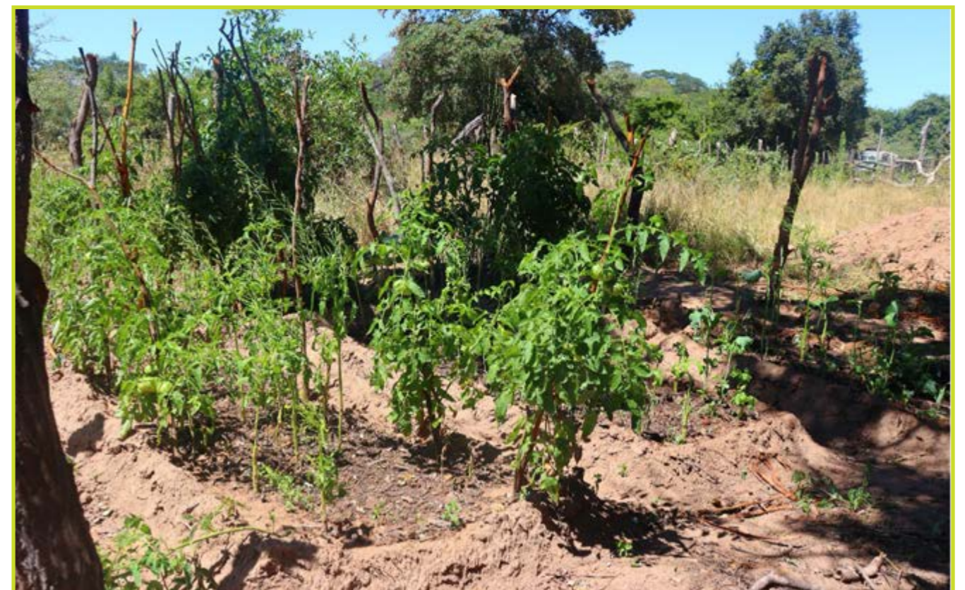
2022: A permagarden showing a reduction of companion crops due to water scarcity.