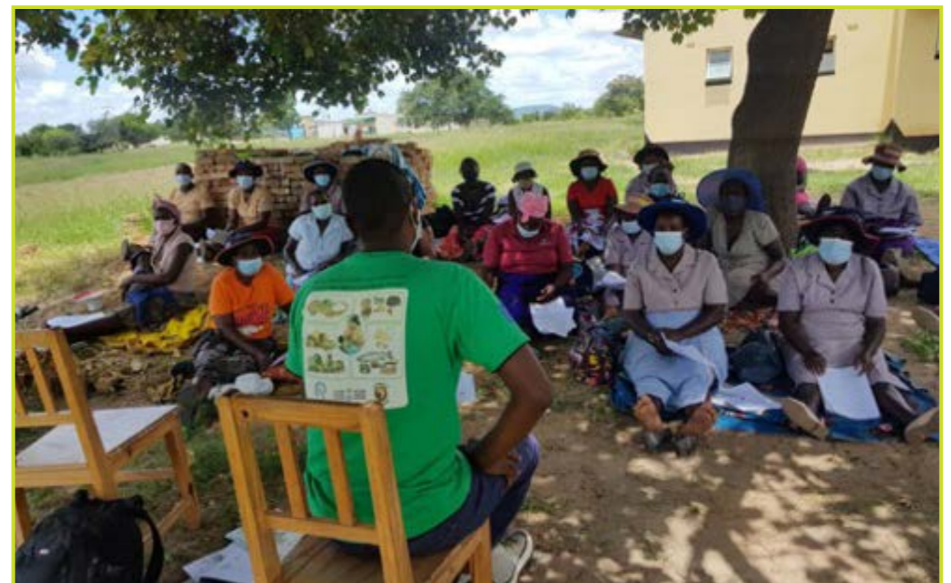
2022: At Berenyazvivi Clinic in Ward 9, buhera, a Takunda facilitator leads a care group training consisting of village health workers and selected women from the community.