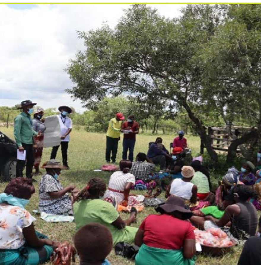
← 2022: A Takunda Gender Officer facilitating an integration of gender issues in VSLA programming during community orientation in Ward 2, Cluster A.